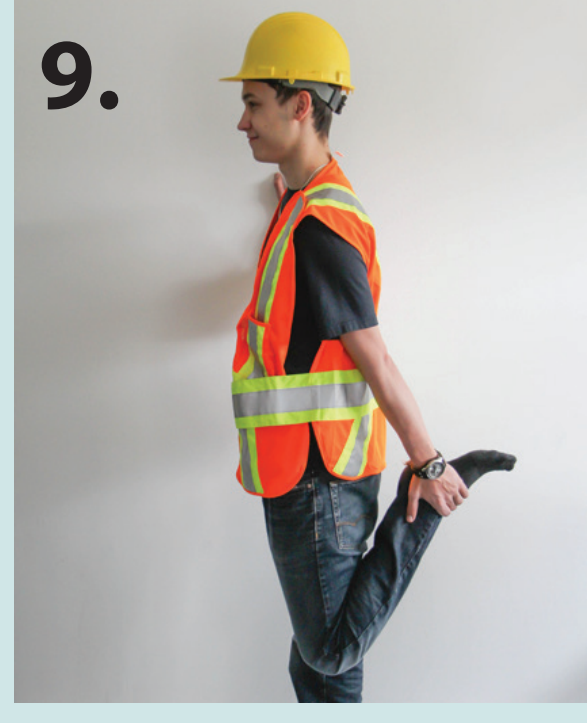
Quadriceps Stretch Hold for 5 seconds on each side