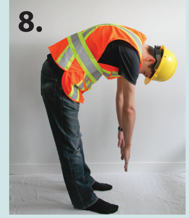
Forward Bend Stretch With knees slightly bent, bend forward with arms hanging. Hold for 5 seconds.