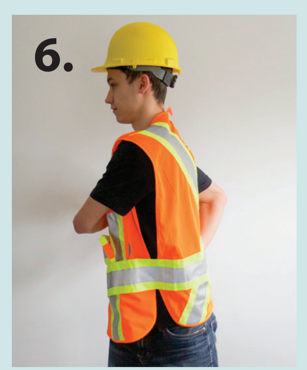
Back Twist Stretch Hold for 5 seconds on each side