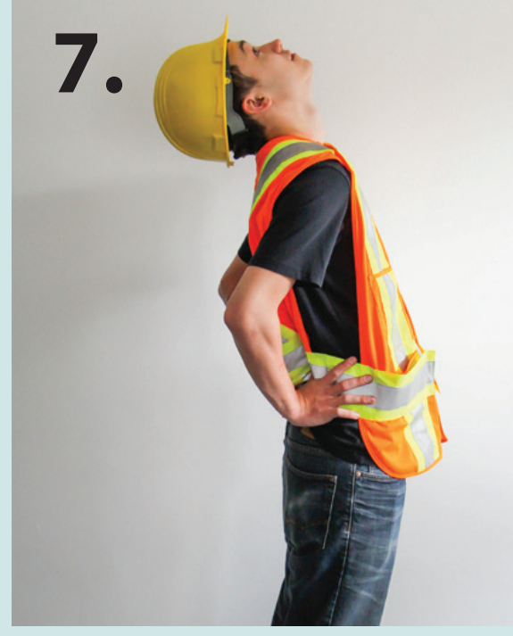
Back Extension Stretch With hands on hips arch your back & look up at the ceiling. Hold for 5 seconds.