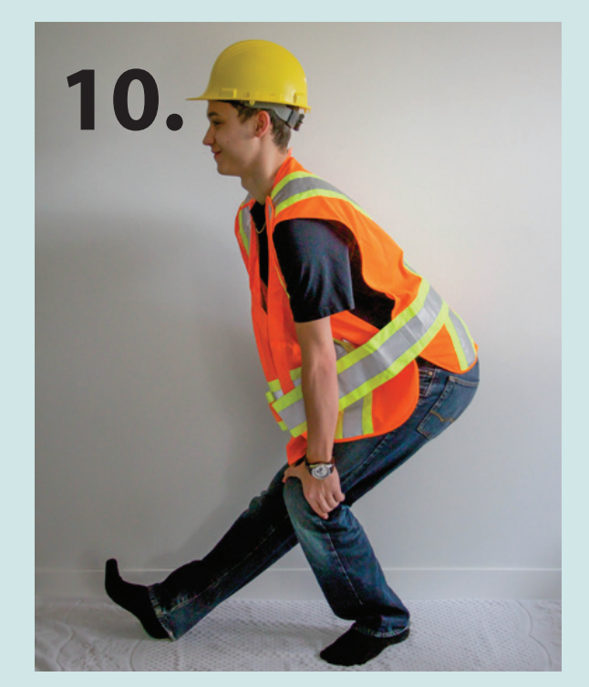
Hamstring Stretch Hold for 5 seconds on each side