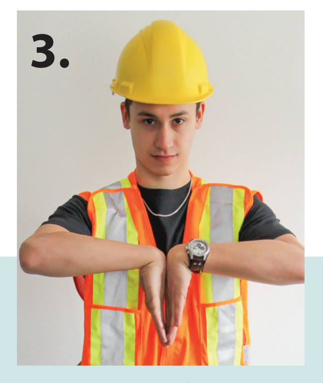
Underside of Forearm Hold for 5 seconds