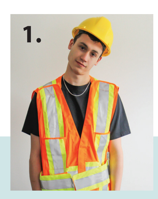
Neck Stretch Hold for 5 seconds on each side

It is important to stretch BEFORE, AND DURING physical work (Approximately every 1/2 hour)