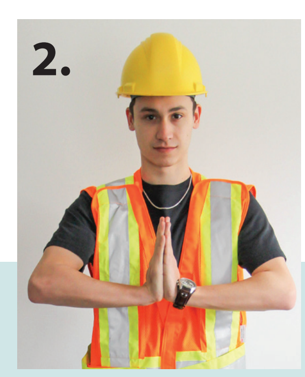
Top of Forearm Hold for 5 seconds