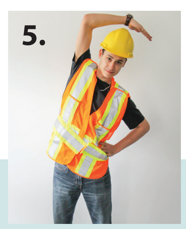
Side Stretch Hold for 5 seconds on each side