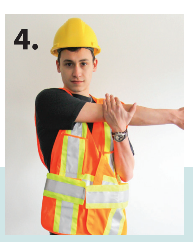
Shoulder Stretch Hold for 5 seconds on each side